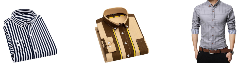
(a) A striped shirt

If a user is looking for a "men's dress shirt with thin vertical stripes", they might expect that this product is a relevant match based solely on the textual metadata. However, when looking at the product images, they would quickly notice that the stripe pattern on the shirt is not "thin" but rather "thick" stripes. Not only that, but many of the different color options in fact have a completely different design and thickness of stripes, while some color options have a checkered pattern instead of stripes (Figure 1).