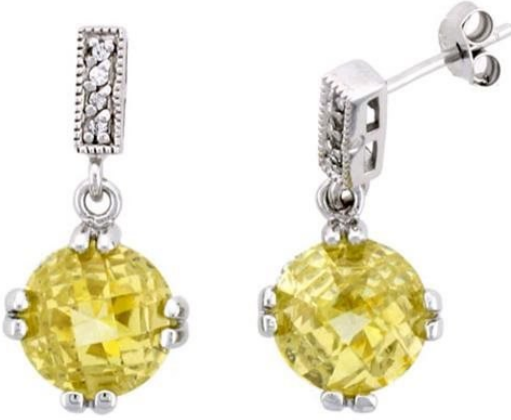
Figure 2: An earring item need to be categorized.